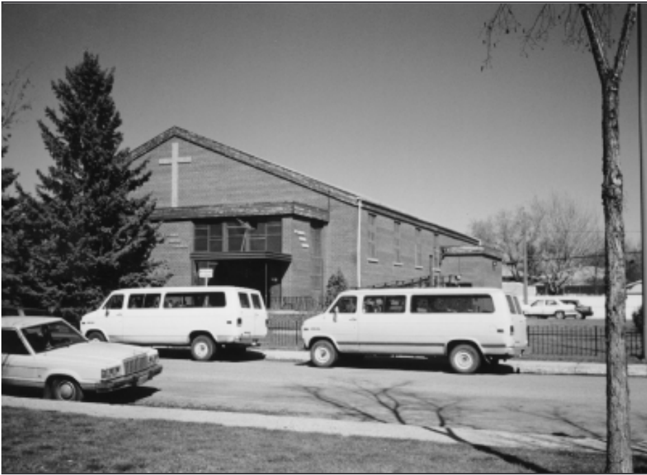
Rainbow's two CVA-leased vans seen in front of their new home at 977 McTavish.